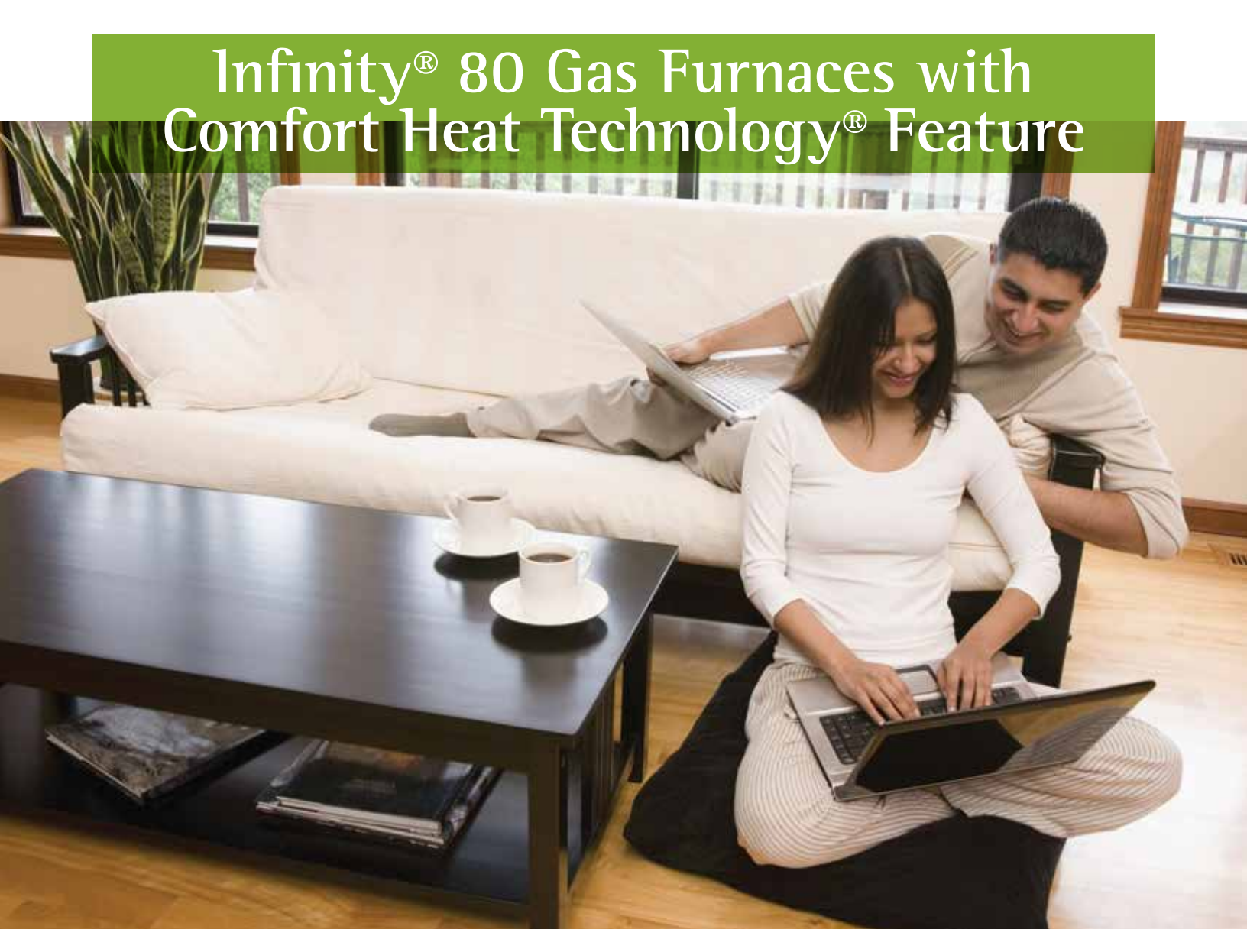
Enjoy enhanced comfort with 80.0% AFUE